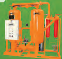
Desiccant Dryers Heatless & Heated