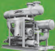
High Capacity Dryers