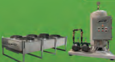
Water Saver and Pumping Stations